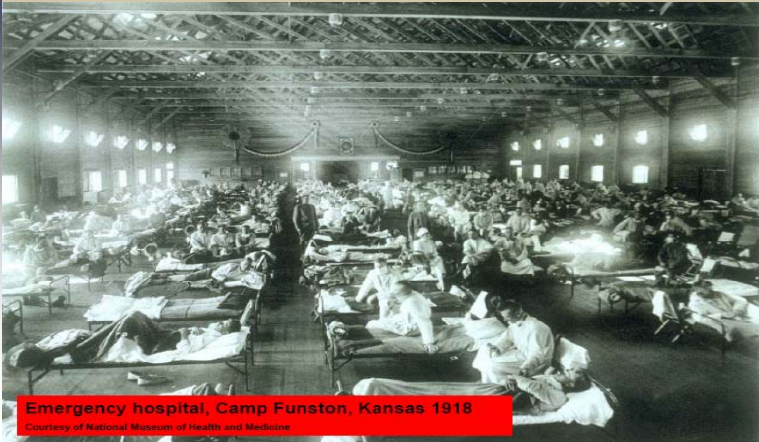
Emergency hospital, Camp Funston, Kansas 1918